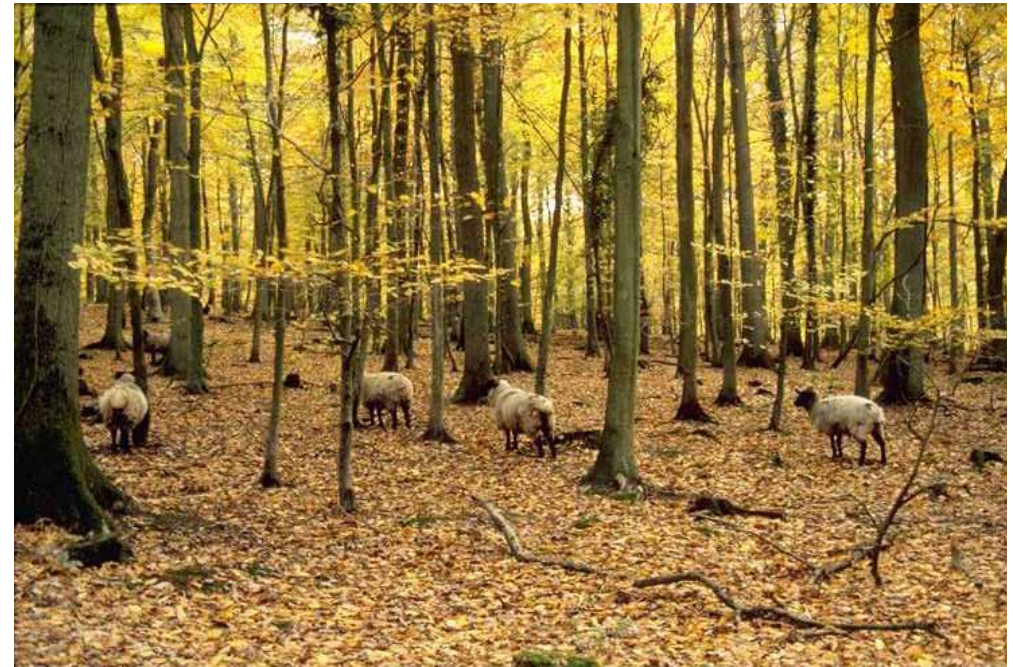
Sheep grazing in the statutory forest.

SEO 4: Protect and enhance assemblages of internationally important species associated with the River Wye Special Area of Conservation (SAC) and River Severn estuarine SAC, employing good land management practice throughout the Forest of Dean and Lower Wye Valley to improve water quality, reduce soil erosion and regulate water flow.