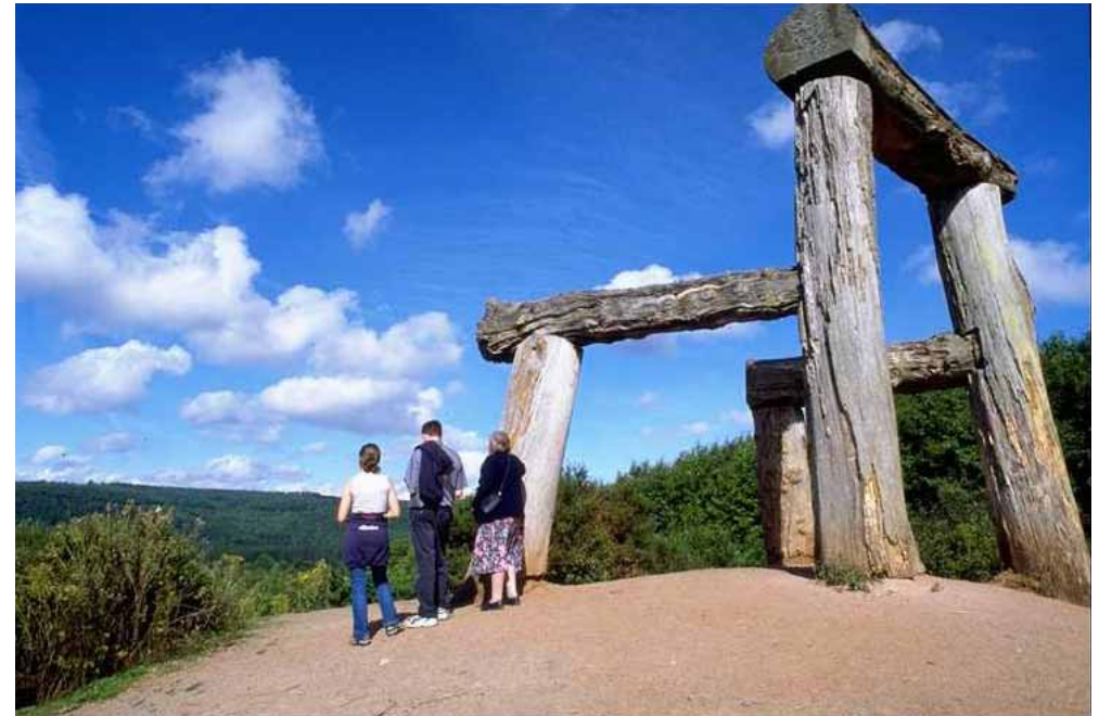
Recreation in the forest: the giants chair, part of the sculpture trail at Beechenhurst lodge.