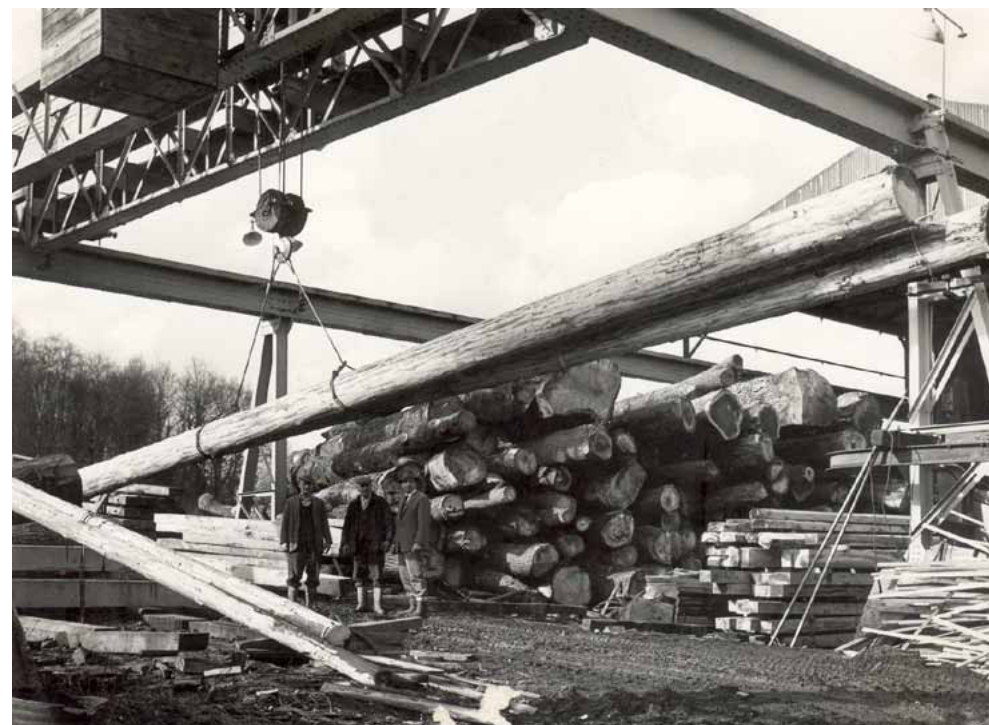
The old sawmill at Parkend.

Please note all figures contained within the report have been rounded to the nearest unit. For this reason proportion figures will not (in all) cases add up to 100%. The convention <1 has been used to denote values less than a whole unit.