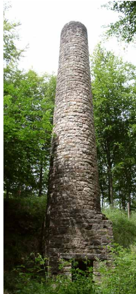
Findles Chimney at Old Staples Edge, ventilation chimney for Perseverance Iron Mine.