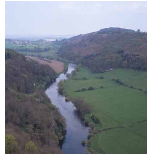
View of the River Wye from Yat Rock.