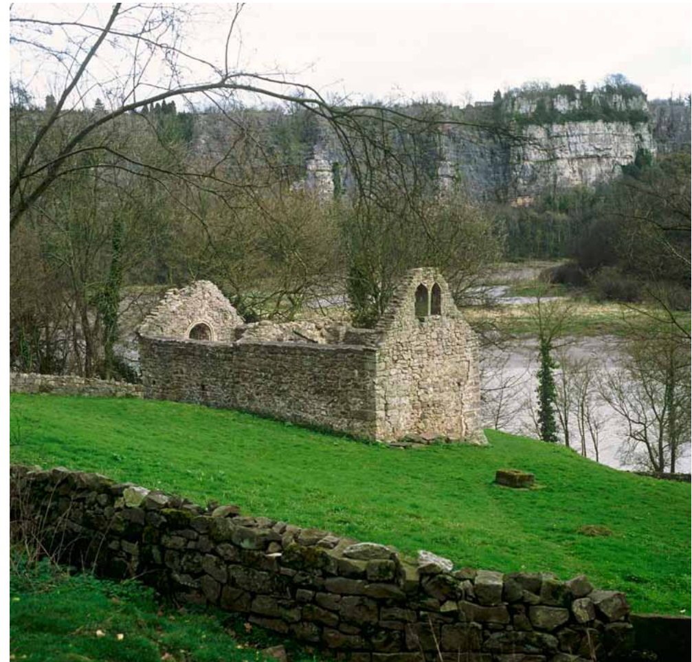
Lancaut medieval church showing the River Wye and the cliffs of Wintour's leap behind.

Industry rapidly expanded in the 16th century, and as exploitation of the coal and iron ore continued into the 17th and 18th centuries, settlements further concentrated around the edge of the statutory forest on the limestone where the iron ore deposits occurred. Most of the Wye Valley woodlands were managed as coppice to provide charcoal for the important iron industries