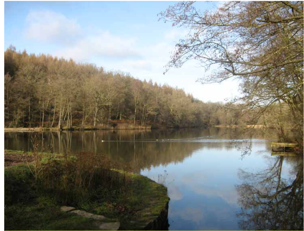
The now tranquil Cannop Ponds at one time supplied power to industrial machinery.