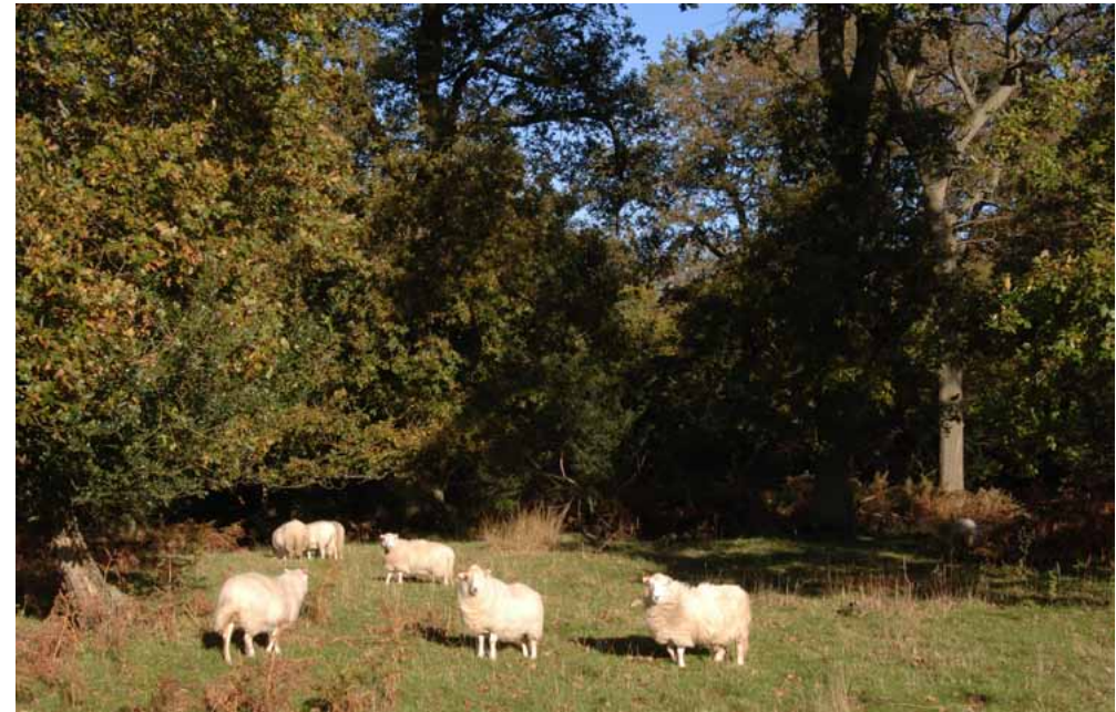
Sheep grazing the Statutory Forest, grazing animals are particularly important for maintaining the forest waste areas as open habitat.