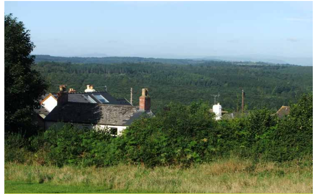
View from Cinderford across the forest to Sugerloaf Mountain far distance.

former royal hunting forest; farming; woodland management; and mineral extraction and its associated industries. Iron and coal have been exploited since pre-Roman times, with a wealth of tips; shallow, small-scale iron workings or scowles; quarry faces; horse-drawn tram roads; and disused railway lines. The area boasts 12th-century Cistercian Abbeys (for example Tintern) and associations with the Picturesque Movement.