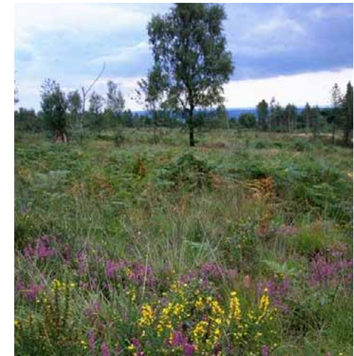
Heathland restoration at Tidenham Chase.