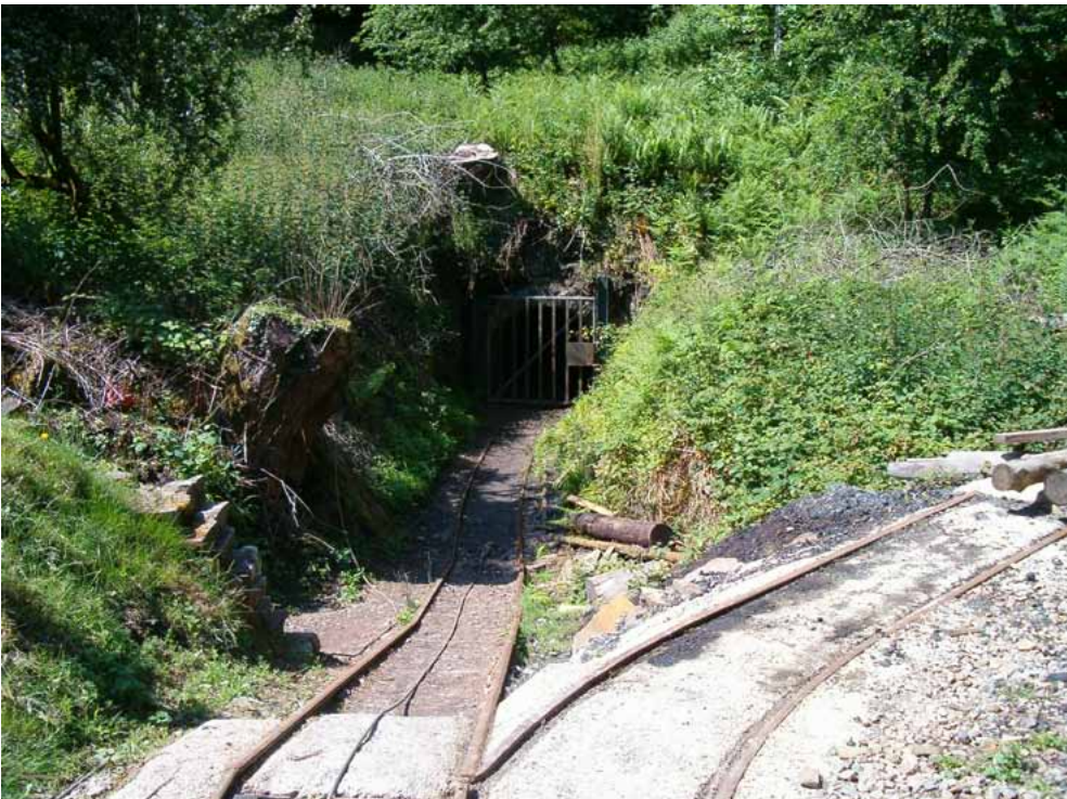
Mine entrance within the statutory forest.

The valuable timber resource was felled indiscriminately until 1668, when the Dean Forest (Reafforestation) Act resulted in the enclosure of 11,000 acres to exclude grazing animals and regenerate the dwindling woodland cover.