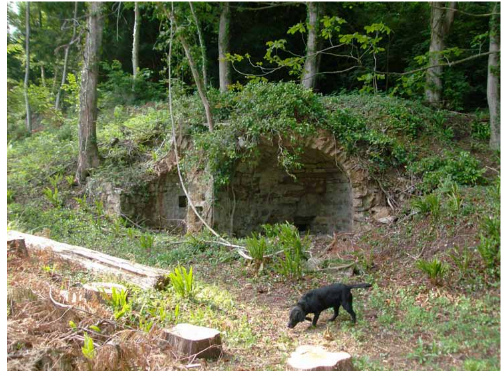
Ashwell Grove lime kiln.

To the south and west, the forested plateau opens out to a high, undulating agricultural landscape of both arable and pasture. Fields are medium-sized, and boundaries are of hedges, with only a few hedgerow trees, and discrete coniferous plantations. In places along the edge of the plateau, networks of sunken lanes, with steep banks and trees towering above, contrast markedly with the more open landscape of this part of the plateau.